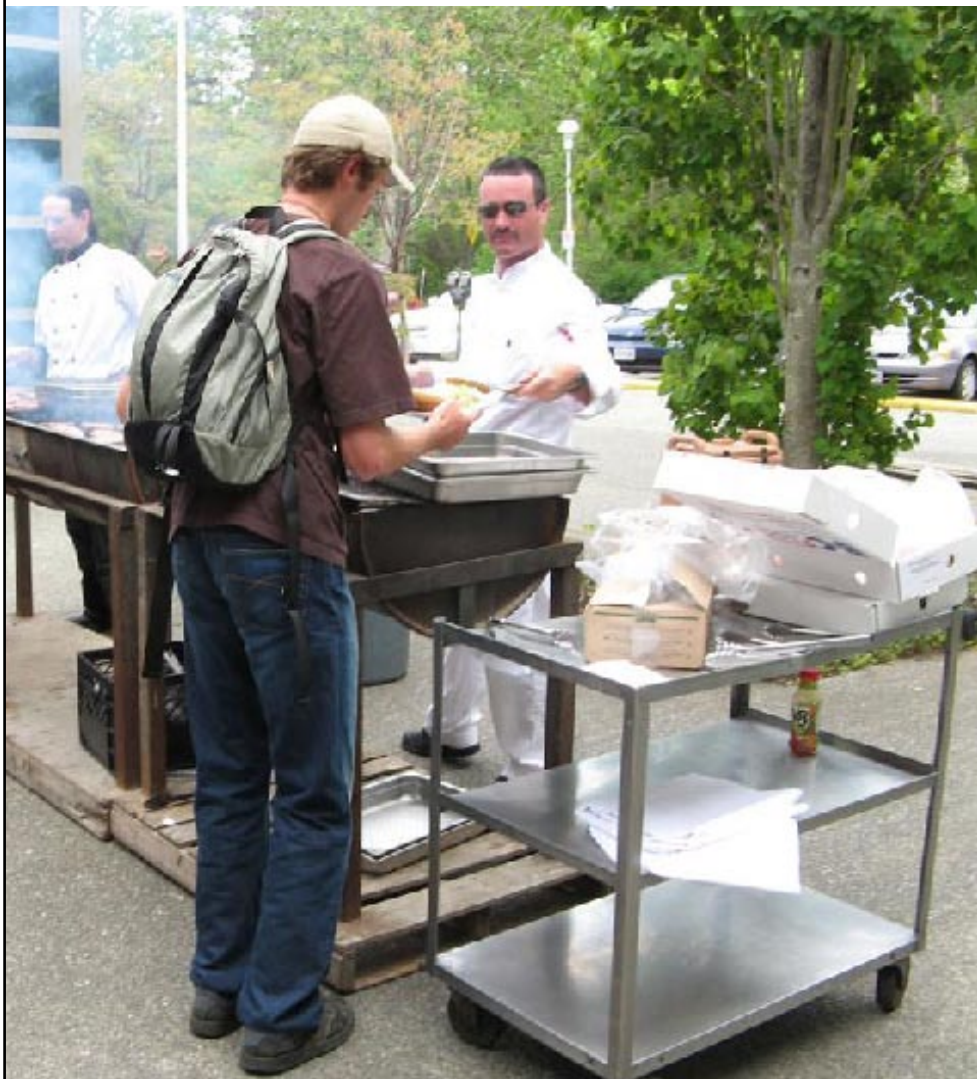
Having burgers at the after AGM barbecue... photo source unknown.