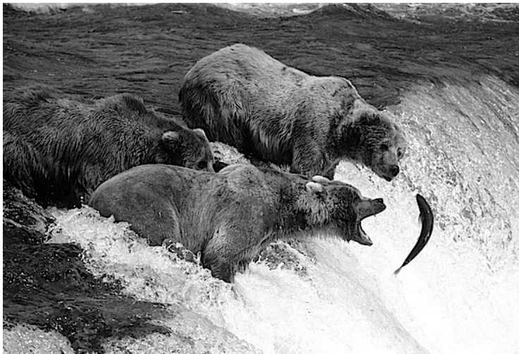
Pictured above: what not to do.

Engineering streams is kinda like normal streams. There's fish (engineering students) and there are bears (classes, exams, labs etc.) Just study and work hard and...well this analogy doesn't work at all.