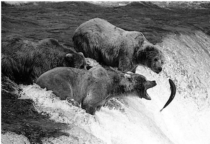
Pictured above: what not to do.

Engineering streams is kinda like normal streams. There's fish (engineering students) and there are bears (classes, exams, labs etc.) Just study and work hard and...well this analogy doesn't work at all.