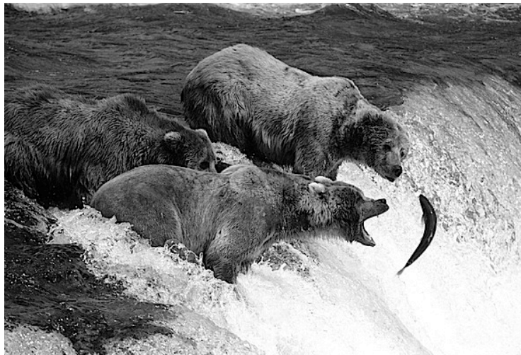
Pictured above: what not to do.

Engineering streams is kinda like normal streams. There's fish (engineering students) and there are bears (classes, exams, labs etc.) Just study and work hard and...well this analogy doesn't work at all.